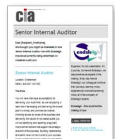
Job Target Email example