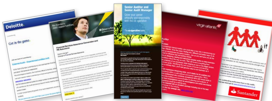
Targeted Emails examples